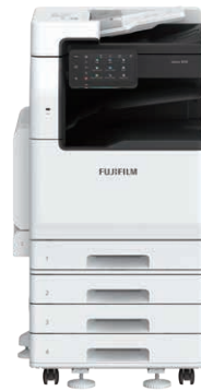
With 3 Tray Module

With 1 Tray Module with Cabinet • 520 sheets capacity tray x 2-tray • Cabinet