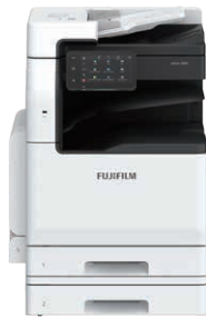
With 1 Tray Module

Standard Tray • 520 sheets capacity tray x 1-tray