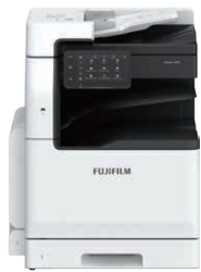
Standard Configuration 1 Tray

Standard Tray • 520 sheets capacity tray x 1-tray