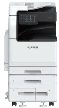
With Tandem Tray Module

With 3 Tray Module • 520 sheets capacity tray x 4-tray