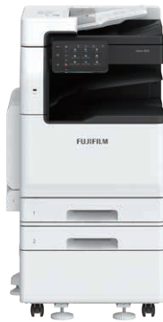
With 1 Tray Module with Cabinet

With 1 Tray Module • 520 sheets capacity tray x 2-tray